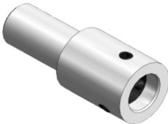
Рис. 1 Pic. 1